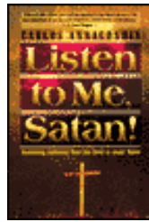
Listen to Me, Satan $13.00