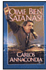
Qime Bien, Satanas! $10.00